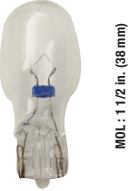
MOL: 1 1/2 in. (38 mm) Ø 5/8 in. (15.90 mm)