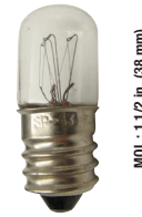
MOL: 1 1/2 in. (38 mm) Ø 1/4 in. (6.35 mm)