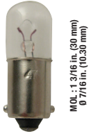
MOL: 1 3/16 in. (30 mm) Ø 7/16 in. (10.30 mm)