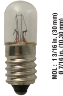
MOL: 1 3/16 in. (30 mm) Ø 7/16 in. (10.30 mm)