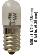
MOL: 1 1/2 in. (38 mm) Ø 1/4 in. (6.35 mm)