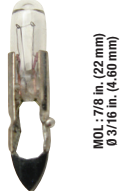
MOL: 7/8 in. (22 mm) Ø 3/16 in. (4.80 mm)