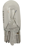
MOL: 1 3/16 in. (27 mm) Ø 7/16 in. (10.30 mm)