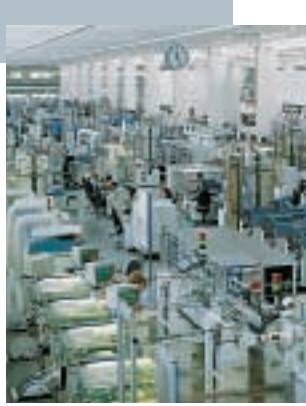
High tech made in Amberg.