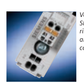
Versatile connection systems: SIGUT, spring-loaded terminal or ring-type cable lug: SIRIUS SC always offers the optimum connection system.