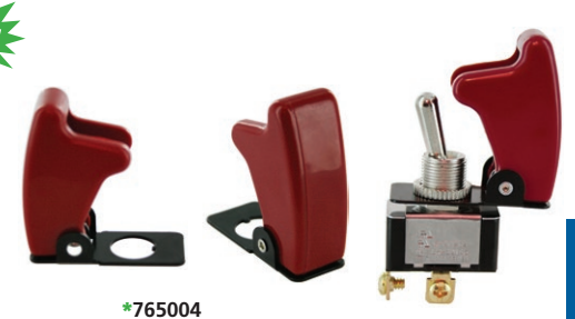
†Toggle switch is not included (for illustrative purposes only)