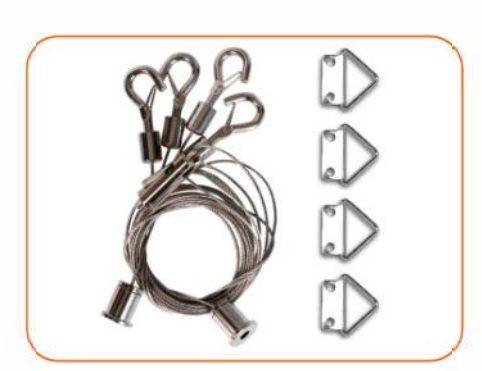
- Suspended Kit