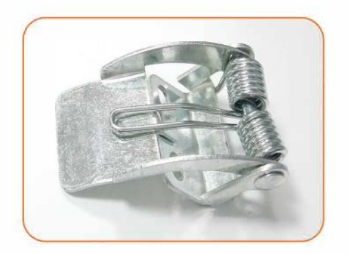
- Spring Clip