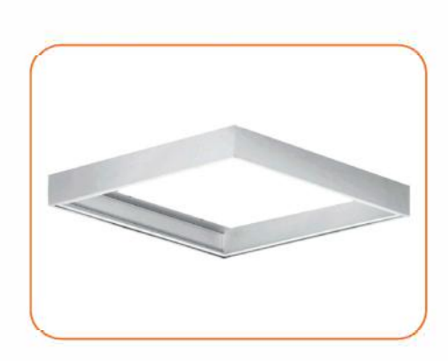
- Surface Mounted Frame