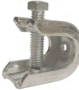
Conduit Beam Clamps