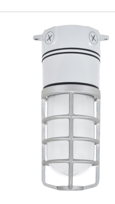
DVAKSX-LED14 shown with GD100CGS Cast Guard and GL100SB Sandblasted Globe.