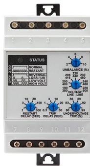
PMD Series with mounting clips extended

Phase Unbalance: Adjustable from 2 - 10% unbalance. Unit trips when any one of the three lines deviates from the average of all three lines by more than the adjusted set point for a period longer than the adjustable trip delay.