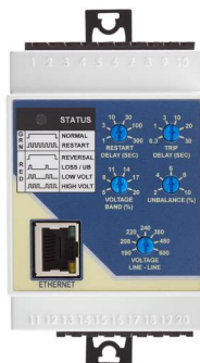
PC Series with terminal blocks removed and mounting clips extended