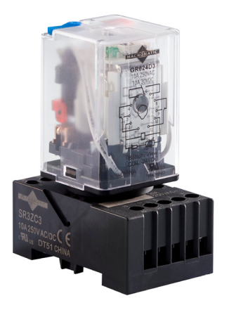
GR120A2 Relay on SR2C3 Socket, left, and GR024D3 Relay on SR3ZC3 Socket, right (Sockets ordered separately)