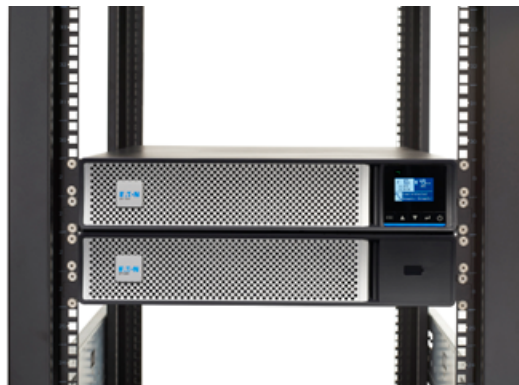
5PX G2 4-post mounting kits are rated (ISTA 3E) to support the weight of a UPS/EBM when mounted in a rack and being transported