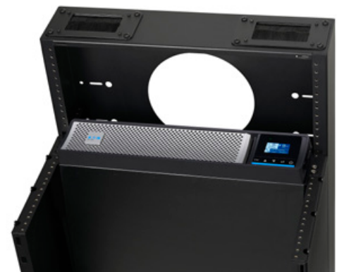
5PX G2 UPS mounted vertically in the MiniRaQ by Eaton, perfect for confined places