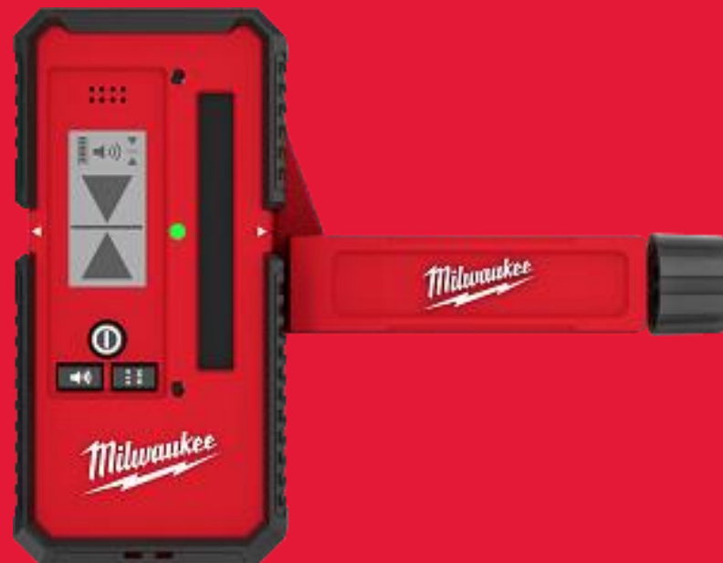
165' Laser Line Detector 48-35-1211

PRE-ORDERS: OPEN NOW | SHIPPING: AUGUST 16 th , 2021