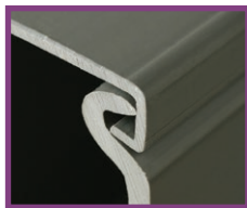
Flush cover design with maximum grip.