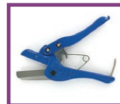
WT-1 – Duct Cutting Tool

Complete selection of accessories and tools for installation: see pages D-8, 9