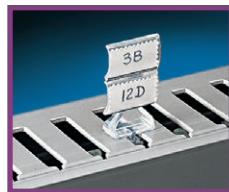
Designed for use with several accessories: wire retainers, label holders etc.