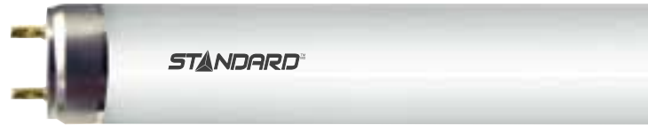
Nominal length : 24 in. (610 mm) Dia. : 1 in. (26 mm)

Order code: 10015 Description: F17T8/35K/8/RS/G13/STD ESV UPC: 69549100152 Case quantity: 25