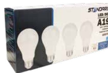
A19 4 pack