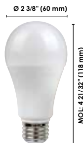
A19 15 W & Trilight