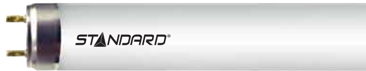
Nominal length : 48 in. (915 mm) Dia. : 1 in. (26 mm)

Order code: 65490 Description: F28T8/841HL/ES UPC: 69549654907 Case quantity: 25