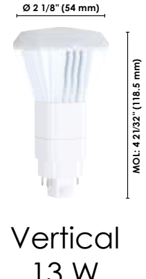
Vertical 13 W