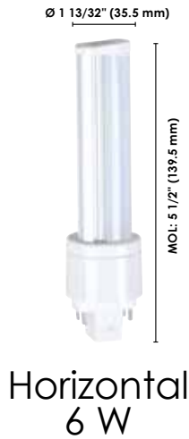
Horizontal 6 W