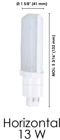
Horizontal 13 W