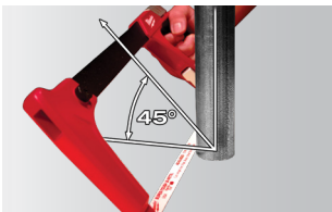
45° Angle Blade Position