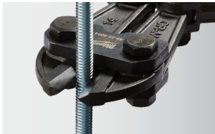
Forged Steel Blades & Custom Heat Treated Maximum durability