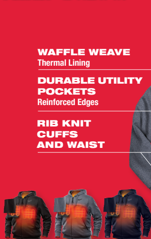
302B 302G 302BL