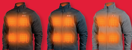
204B 204BL 204G