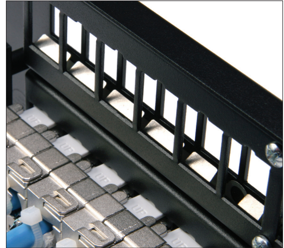
The stainless steel plate ensures a proper ground path between the connector and the panel.