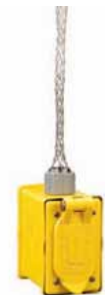
Deluxe Cord Grips (purchased separately)