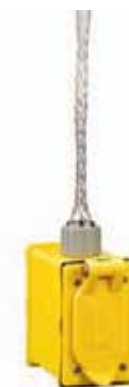
Deluxe Cord Grips (purchased separately)