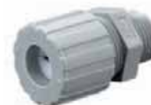
Gray Nylon Cord Connector