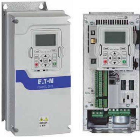
DH1 HVAC/R Drive