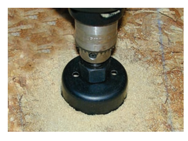
2. Drill hole in floor using hole saw.