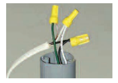
4. Connect receptacle wires to cable. Be sure to match wire colour(s).