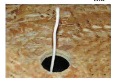
3. Pull cable through floor.