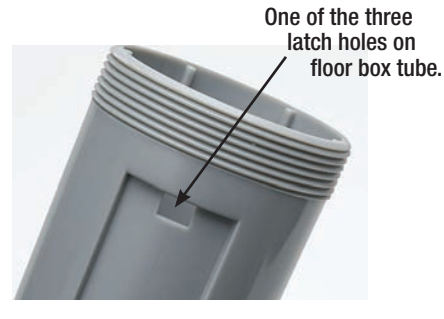
Align the three latches on the low voltage plate with the three latch holes in the round floor box tube.