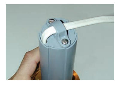
5. Secure wire clamp on bottom of tube.