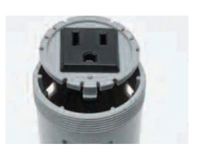
8. Remove receptacle by pressing three tabs located on side of tube.