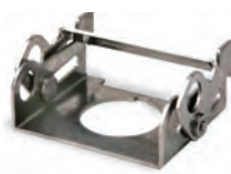
Emergency Stop Cover IEC 22.5mm (PBL4)