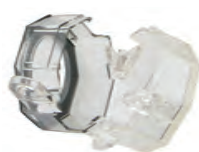
Push Button Cover NEMA 30.5 mm (PBL6)