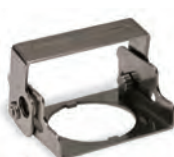
Emergency Stop Cover NEMA 30.5mm (PBL2)