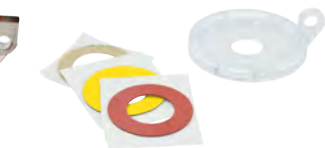
Each base supplied with 1 yellow label, 1 red label and adhesive backing.