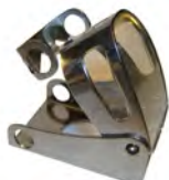
Push Button Cover IEC 22.5mm (PBL8)