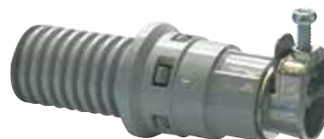
Kwikon Adapter for ENT to AC90