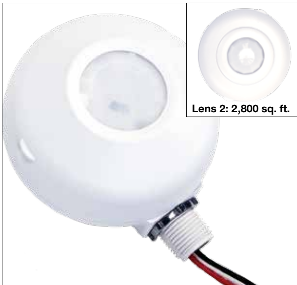
Lens 2: 2,800 sq. ft.

Operating Temperature: 32°F to 131°F (0°C to 55°C)