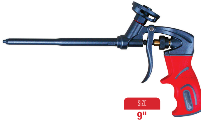
SIZE 9" FOAM GUN