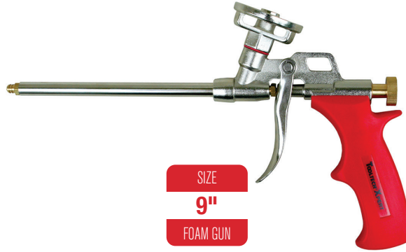
SIZE 9" FOAM GUN