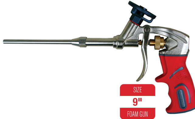
SIZE 9" FOAM GUN