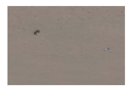
1. Mount stainless steel clips on the surface