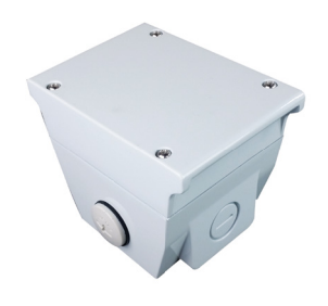
Junction Box Accessory (order separately)