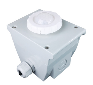
Junction Box Accessory with Sensor (factory installed)