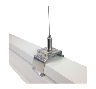
Pendant Mount accessory