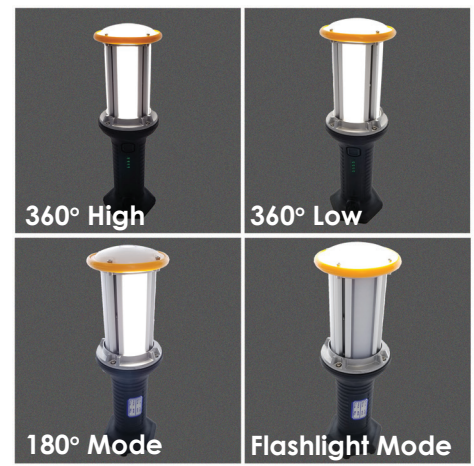
LE360LEDHC battery operated worklight with 4 light settings