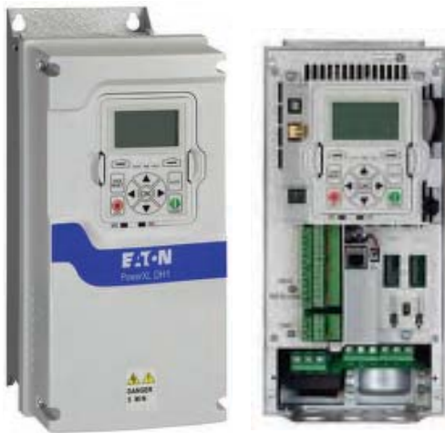
DH1 HVAC/R Drive