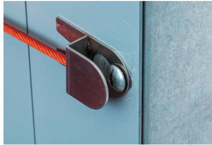
Under panel screws