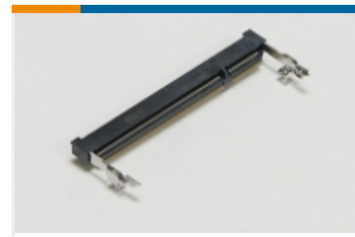
SO DIMM Sockets(12)