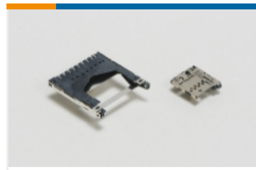
SD Card Connectors(2)