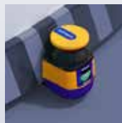
Safety Laser Scanner