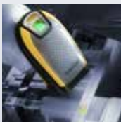
Hand Held scanners