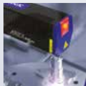
Laser Marking Systems