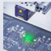
Stationary Industrial Scanners