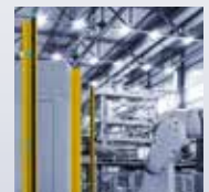
Safety Light Curtains