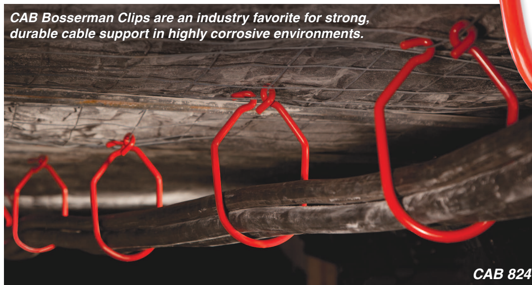
CAB Bosserman Clips are an industry favorite for strong, durable cable support in highly corrosive environments.