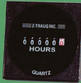
T50E Square facia Plaque avant carrée