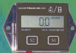
MT14R 3 in 1 Meter for Gasoline engines 3 en 1 pour les moteurs à essence