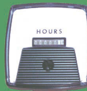
502/503 HRM 2 1/2" & 3 1/2" facia