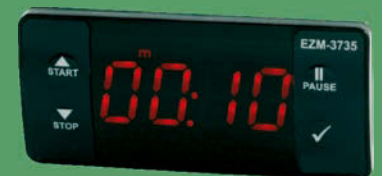
EZM3735 SPDT Contact & programmable buzzer sortie type C et klaxon programmable