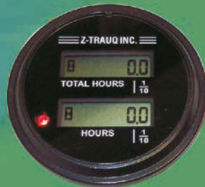
T12 Programmable with SPDT output Programmable avec sortie type C