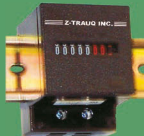
BDHRM DIN rail mount Montage sur rail DIN