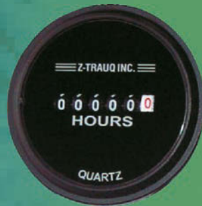
T50A To SAE specifications Selon les normes SAE