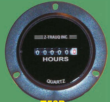
T50B NEMA 4X