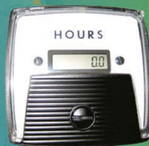
502/503 HRD 2 1/2" & 3 1/2" facia