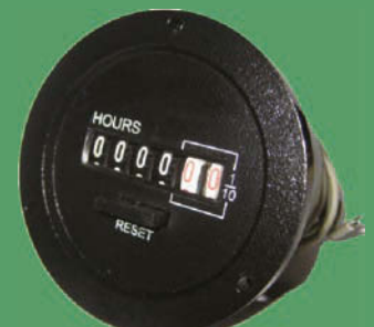
T55 Resettable à réarmement