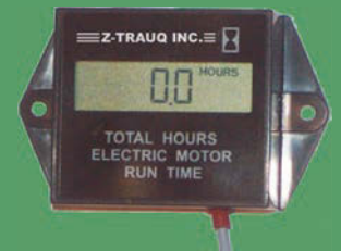
MT15 No wiring Sans filage