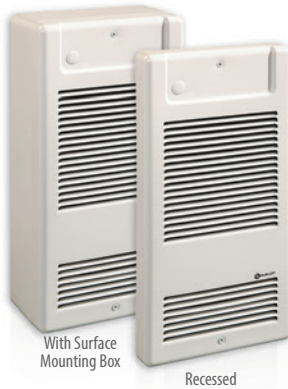
With Surface Mounting Box