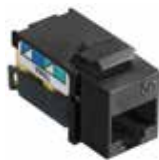
Snap Fit Jack NSJ5EBK

xx = Color: BK (Black), B (Blue), GY (Gray), GN (Green), I (Ivory), LA (Light Almond), OR (Orange), R (Red), W (White) and Y (Yellow) *Available in BK, B, LA, OR and W only.