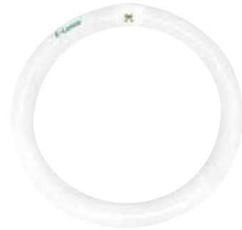
Nominal diameter : 12 in. (305 mm) Dia. : 1 1/2 in. (29.5 mm)

Order code: 56517 Description: FC12T9/CW/RS/4P/ELUME UPC: 69549565173 Case quantity: 24