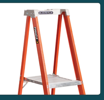
3 Handrail Height for Tool Belts 30" heavy-duty handrail runs from platform to peak providing a secure 3-sided barrier.

Spacious platform allows for more secure, comfortable movement.