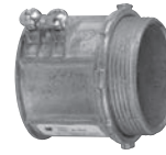
CI5020 (-IT) / CI5032 (-IT)