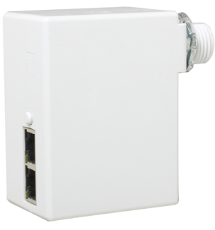
Model #: nPP16 (D) EFP