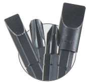
BITS FOR IMPACT DRIVER SET 70229