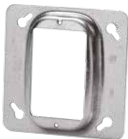
CI52-C-10 to CI-52-C-62