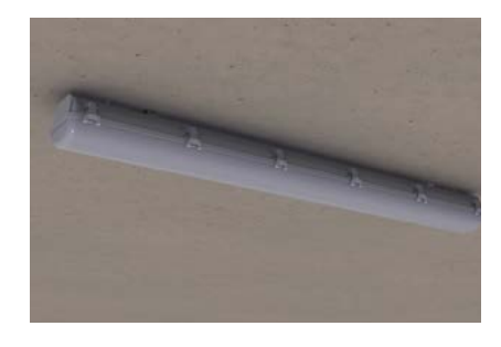
2. Mount fixture onto clips