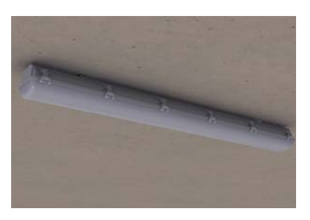
8. Reattach the lens to the fixture