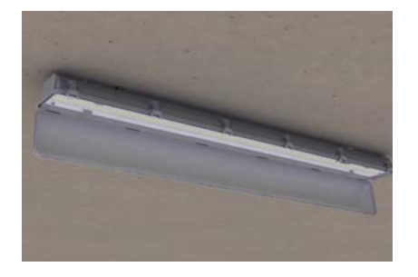
3. Open up the lens by unhooking polycarbonate clips on one side