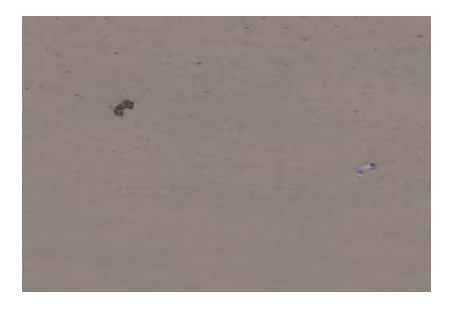
1. Mount stainless steel clips on the surface