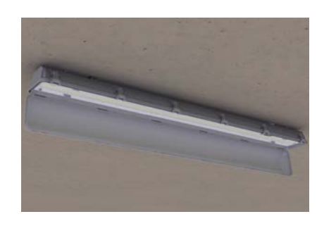
7. Reattach the tray to the fixture