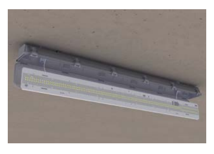
4. Remove LED tray using the pull tabs on either side of the fixture