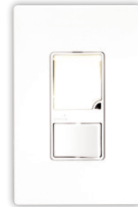
7738W PJS26W Wallplate