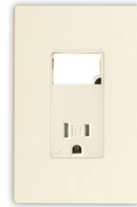
TR7735LA PJS26LA Wallplate