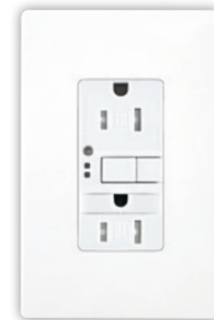
TRSGFNL15W PJS26W Wallplate