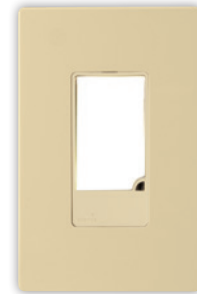
7737V PJS26V Wallplate