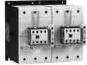
Frame F and G