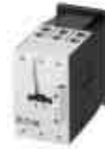
Frame F – G