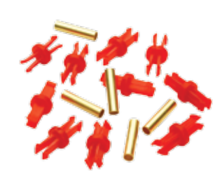
USPTH Pin-Tie Accessory