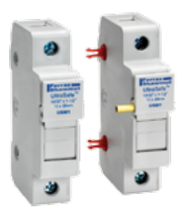
USM1 with USPTH Pin-Ties