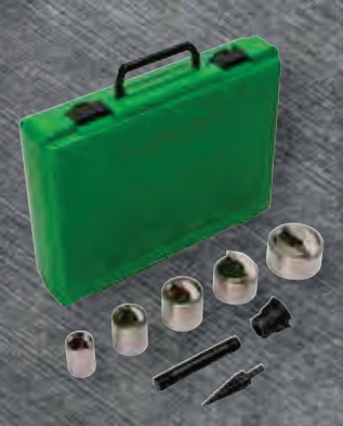
SPEED PUNCH™ KIT (without driver)*