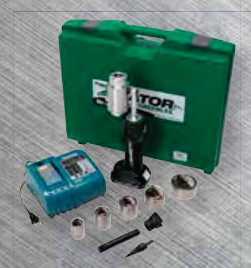
SPEED PUNCH™ KIT (w/LS50 Driver)