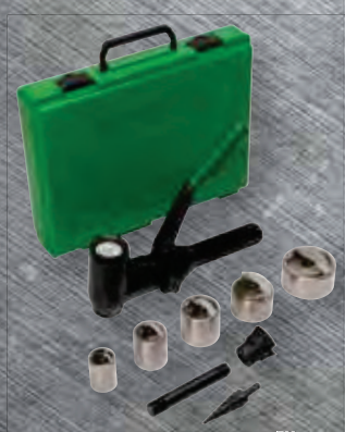
SPEED PUNCH™ KIT (w/Quick Draw 90 Driver)