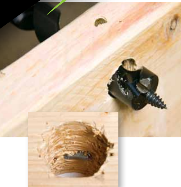
The patented tip pulls through the wood without pushing to finish the hole. The tool steel cutting edge prevents splintering for less mess and better results.

The new Nail Eater® R/T can be used in various woods including pine, green treated wood and telephone poles, providing maximum versatility. Just another way Greenlee makes the job faster, safer, and easier.