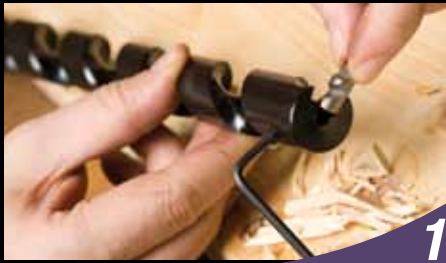
Insert Cutting Edge...

Easy & Fast to Replace in the Field. Get Back to Work in Seconds.