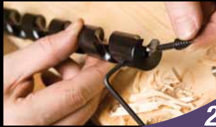
Insert Feed Screw...