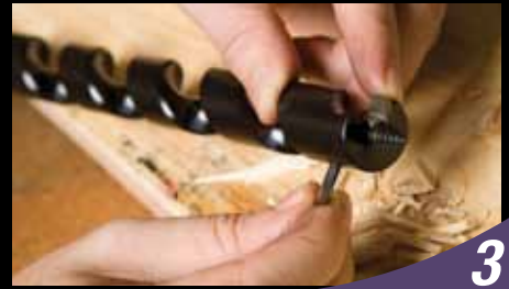
Tighten Set Screw.

See instruction manual for detailed assembly instructions.